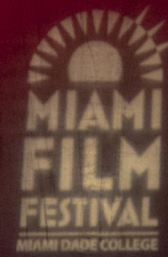
HBO's Behind the Curtain Party, Olympia Theater, MFF 2019